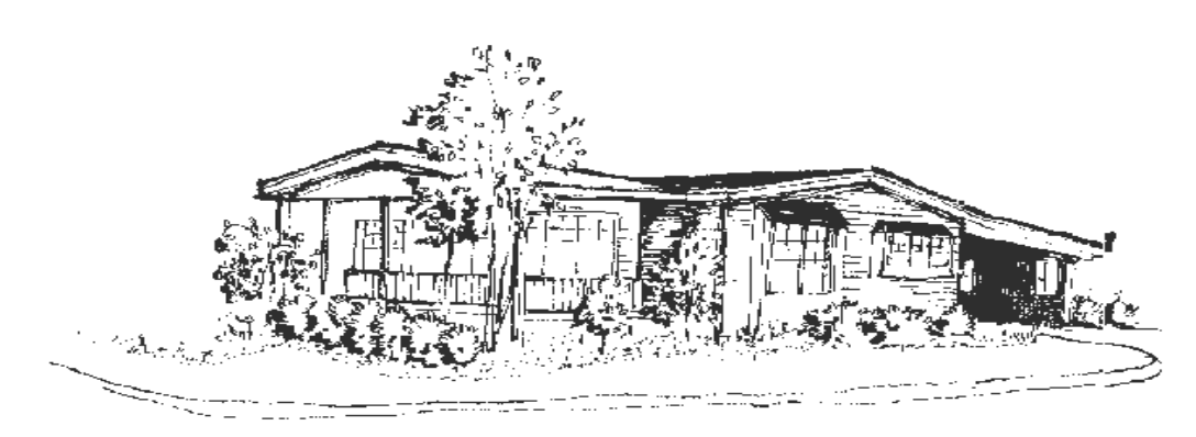
Figure 2 - Manufactured Home Residential Design

Residential Character: Architectural Details: Manufactured Home Features: Covered Entry Window Elements Horizontal Lap Siding Front Porch Permanent Masonry foundation Landscaping Double-wide Manufactured Home