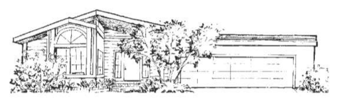
Figure 3 - Modular Home