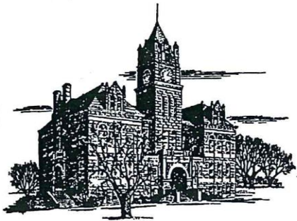
MARION COUNTY COURTHOUSE