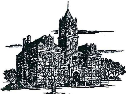
MARION COUNTY COURTHOUSE