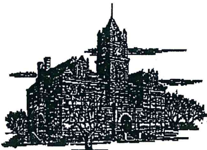
MARION COUNTY COURTHOUSE