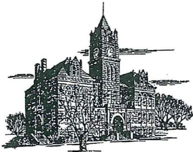
MARION COUNTY COURTHOUSE