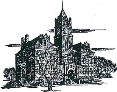
MARION COUNTY COURTHOUSE