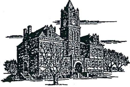
MARION COUNTY COURTHOUSE