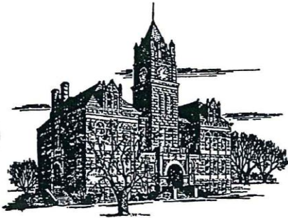
MARION COUNTY COURTHOUSE