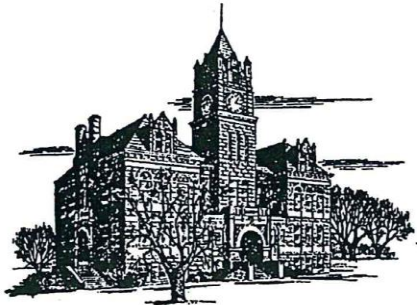
MARION COUNTY COURTHOUSE