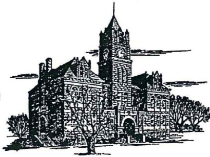
MARION COUNTY COURTHOUSE