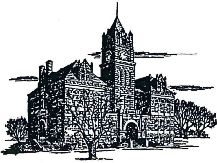
MARION COUNTY COURTHOUSE