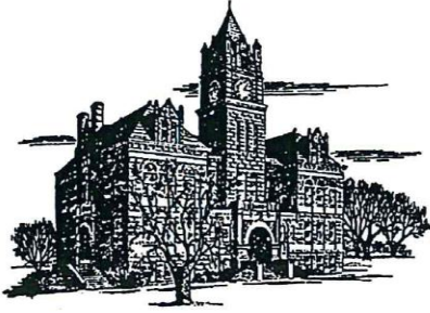
MARION COUNTY COURTHOUSE