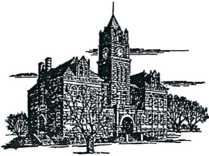
MARION COUNTY COURTHOUSE