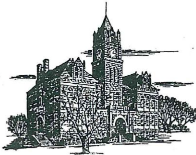
MARION COUNTY COURTHOUSE