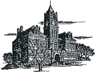
MARION COUNTY COURTHOUSE