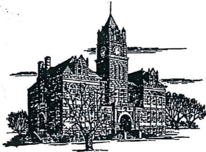
MARION COUNTY COURTHOUSE