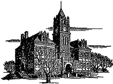
MARION COUNTY COURTHOUSE