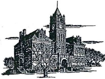
MARION COUNTY COURTHOUSE