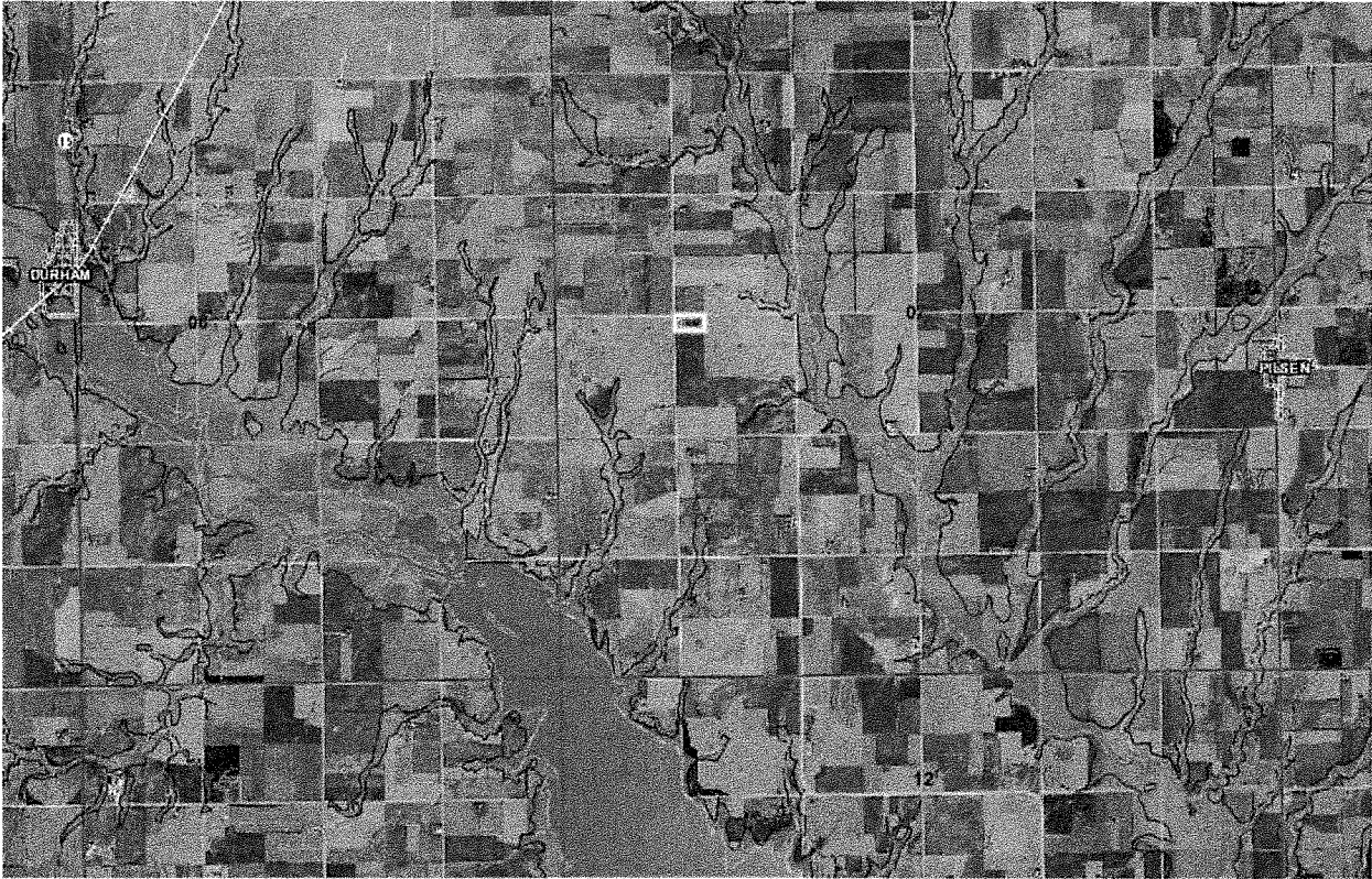
Between Durham and Pilsen, north of the Marion County Reservoir, at the intersection of Mustang and 280 th .