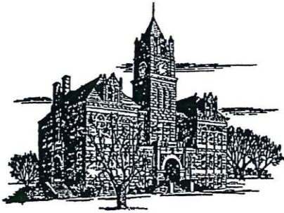
MARION COUNTY COURTHOUSE