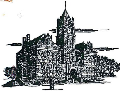
MARION COUNTY COURTHOUSE