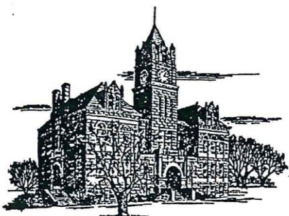
MARION COUNTY COURTHOUSE