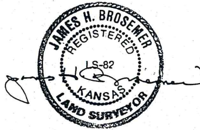
PLAT OF SURVEY